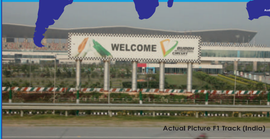
Actual Picture F1 Track (India)

Presithum is located in a tranquil area yet just a few steps from the action.