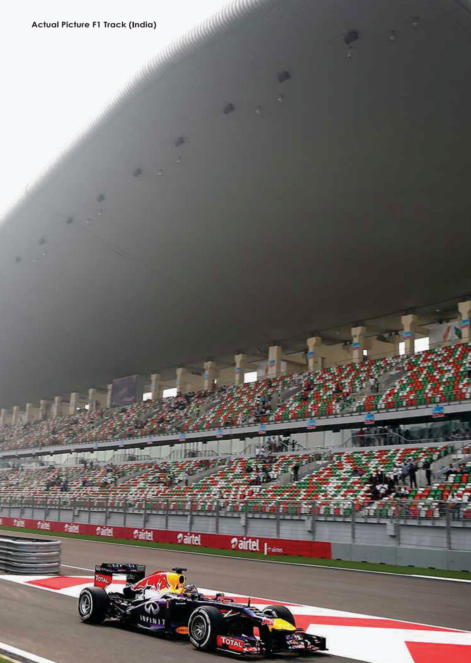
Actual Picture F1 Track (India)