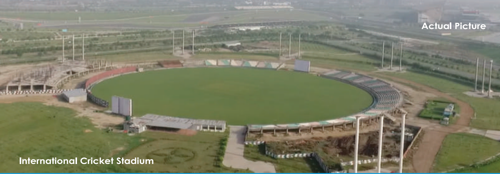
International Cricket Stadium